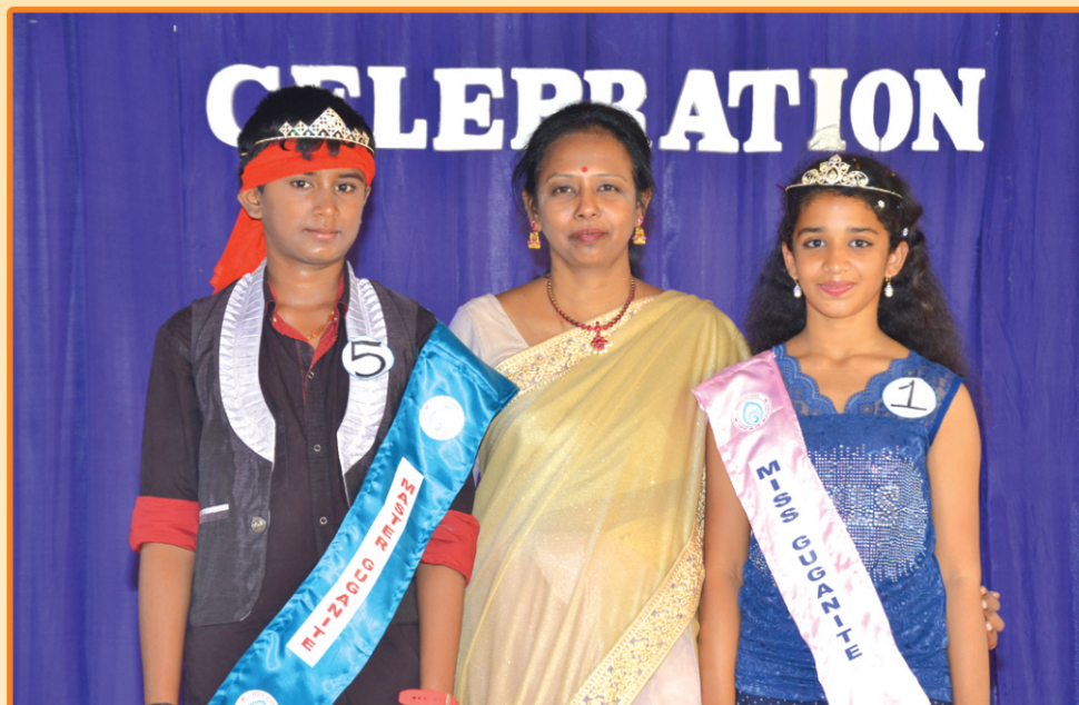
Master and Miss Guganites