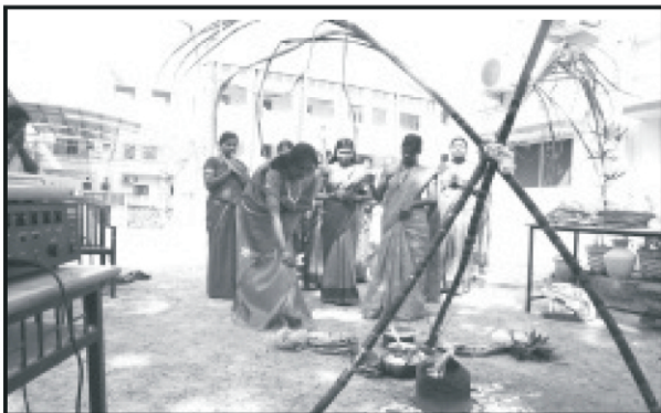
Pongal Day Celebration