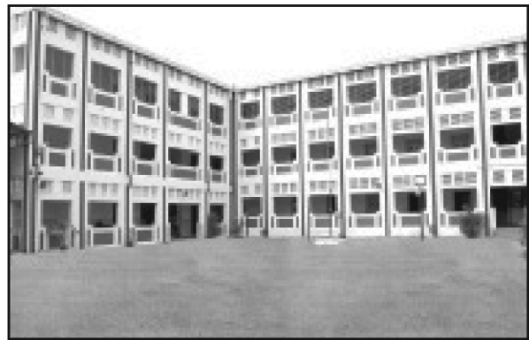
School Building View