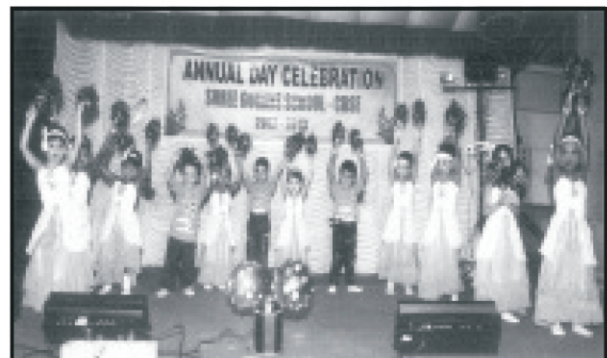
Annual Day Celebration

School has its own vast play ground for Games & Sports. In addition to these creative activities, we also have Public Speaking & Motivational Classes, Coaching for Chess and Band Set.